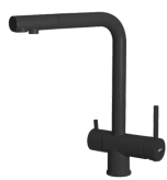
MKKT0U86 K86 8032557560814