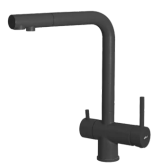
MGKT0U40 G40 8031873102876