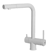
MGKT0U68 G68 8031873102890