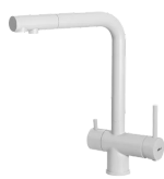
MKKT0U96 K96 8032557560821