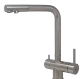
MIKTOUIN IN 8031873651374